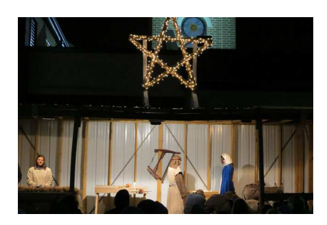
St. Paul's Lutheran Church in Franklin will be having its Living

Nativity on Saturday, December 20th and Sunday, December 21st from 6:00 – 8:00 pm. This is a live presentation of the Christmas Story by actors and live animals Performances will be at 6:00pm, 6:30pm, 7:00pm and 7:30pm each night. Anyone is welcome to attend. Please bring your friends or neighbors.